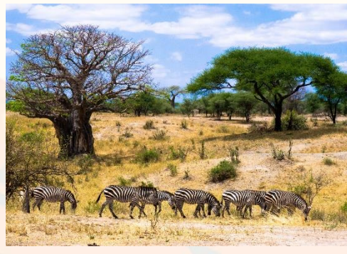
Day 2: Ngorongoro Game Drive in the Morning Then Drive Back To Arusha

On this day it is best to leave the hotel as early as possible so you can see the variety of animals that are only active during the morning hours; breakfast will be packed in lunchboxes specifically for this purpose. At 6:30 AM you will set off for Ngorongoro Conservation Area, and after about an hour you will already be inside the crater. By lunch time you will drive back to Arusha and have your lunch.